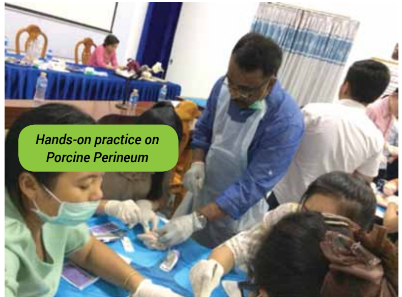
Hands-on practice on Porcine Perineum