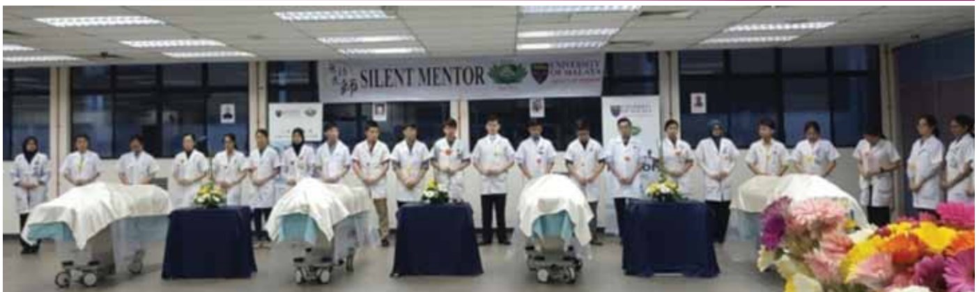
Medical Students get ready for silent prayer after preparation of their mentors by themselves

The undergraduate medical students training program is not just a surgical anatomy and skill workshop. Medical students are assigned to one mentor with eight to ten students per group. The program includes receiving the Silent Mentors within six hours of death, home visits to know the life story, medical illness and the final wish and expectation of their respective mentors from the relatives, preparation of their own mentors before, during, and after each workshop, presentation about their mentors to the participants before the speciality workshop and at Gratitude Ceremony to the public. The students have the opportunity for hands-on surgical anatomy and basic surgical skill training on their mentors in three consecutive evenings. The skill training includes the insertion of chest tube, endotracheal intubation, insertion of central line, and suturing of wounds. From January 2017, we introduced teaching surgical anatomy of abdomen and pelvis after demonstration for laparotomy through midline incision and Pfannenstiel incision, also procedures such as appendectomy, leg fasciotomy, etc.