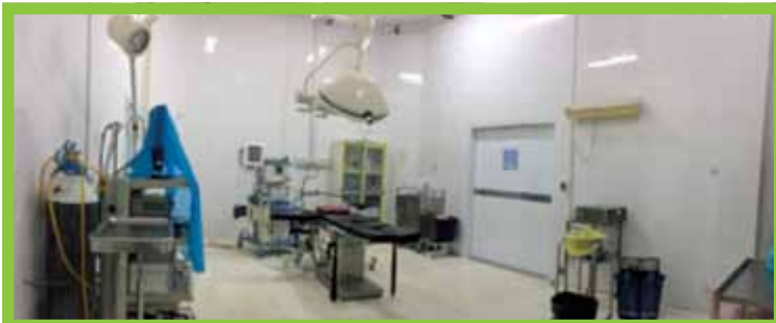
One of the 2 operation theatres in Vientiane Women & Neonate Hospital