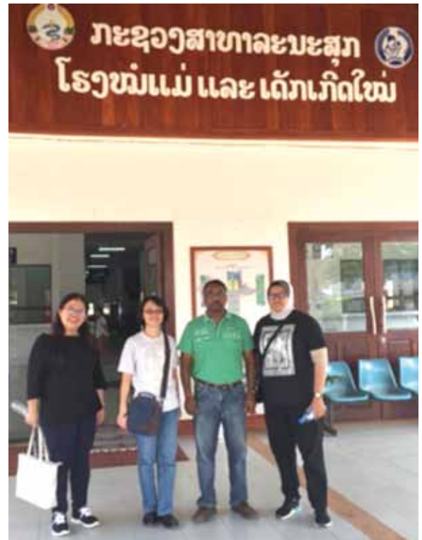
Women and Neonate Hospital Vientiane

The team arrived in Vientiane on 28 th October and proceeded to work soon after arriving. The mission was held at the Women and Neonate Hospital Vientiane. This was the first and only Maternal & Newborn Hospital in Laos. After a quick tour of the hospital premises and facilities, the team proceeded to assess women with urogynaecological problems, who had been screened beforehand by the local hospital doctors. Out of 10 women reviewed, but only 3 patients were identified for surgical intervention, including 2 women with advanced Stage 4 pelvic organ prolapse and 1 patient with 3rd degree tear repair with bad wound dehiscence.