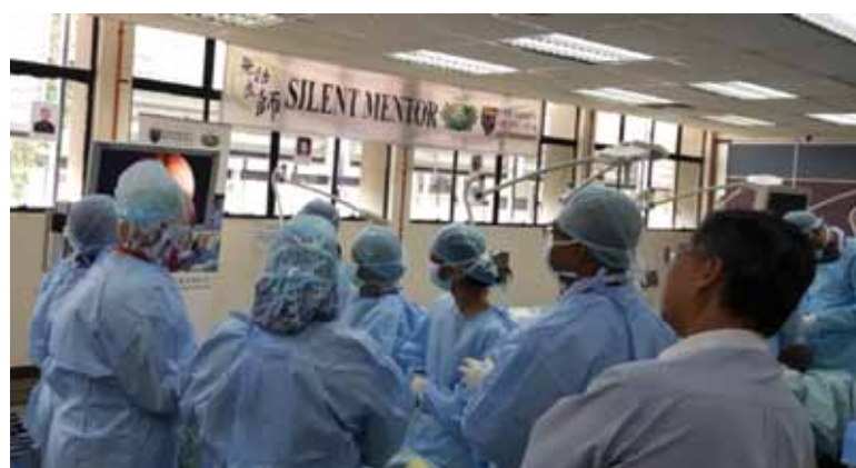
Gynaecological Laparoscopic Hands-on Surgical Workshop