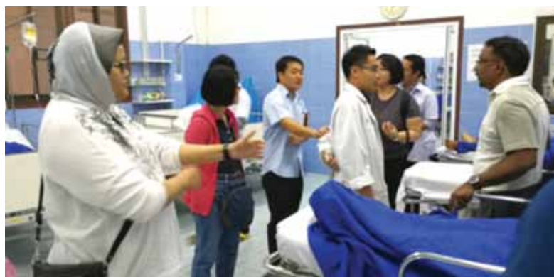
The Team doing post-op review the following morning after surgery

On the final day of the mission, the team visited the hospital to conduct a post-operative ward round to ensure that the patients were on the road to an uncomplicated recovery. We found that the 3 patients were nursed in the recovery area of the operating theatre. Although somewhat uncomfortable for the patients, this enabled them to have better monitoring in the critical post-operative period due to logistic reasons in the local setting. All 3 patients were recovering well, and we educated the local registrars about post-operative management for urogynaecology patients, which included pain relief, prevention of thromboembolism, catheter care and the trial of void protocol and follow-up. As with the common problems with mission such as this, the importance of post-operative care cannot be overemphasized as the team cannot be present onsite throughout the entire recovery period and also to assess patients in the immediate and short-term post-operative period, which would be the ideal situation. We however ensured that the local doctors would be able to contact the operating team for advice should the need arises so as not to compromise patient care.