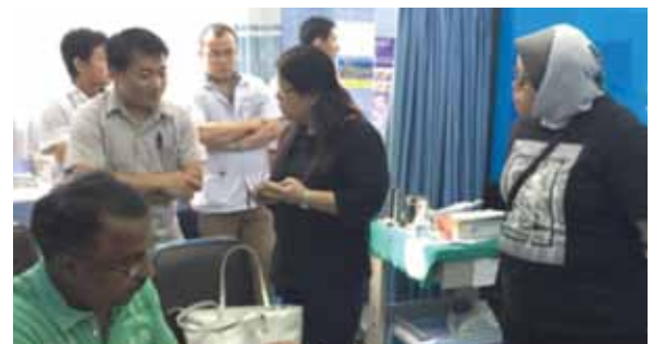
O & G clinic at Vientiane Women's Hospital

The team arrived in Vientiane on 28 th October and proceeded to work soon after arriving. The mission was held at the Women and Neonate Hospital Vientiane. This was the first and only Maternal & Newborn Hospital in Laos. After a quick tour of the hospital premises and facilities, the team proceeded to assess women with urogynaecological problems, who had been screened beforehand by the local hospital doctors. Out of 10 women reviewed, but only 3 patients were identified for surgical intervention, including 2 women with advanced Stage 4 pelvic organ prolapse and 1 patient with 3rd degree tear repair with bad wound dehiscence.