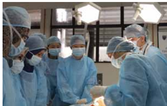
Teaching medical students Pelvic anatomy through Pfannenstiel incision