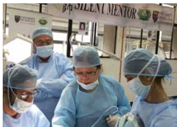
Mid-Urethral Sling Hands-on Workshop

To date, since 2012, 20 Silent Mentors workshops were conducted in the University of Malaya, 74 Silent Mentors were initiated and 754 medical students from local and oversea universities were trained by volunteer trainers from University Malaya, other local universities and specialists from government and private hospitals.