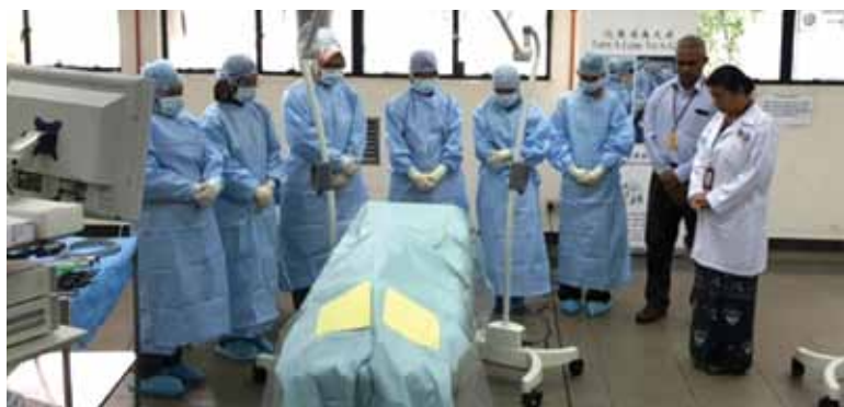
Silent Prayer before Gynaecological Laparoscopy Workshop