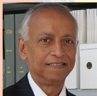
Sir Sabaratnam Arulkumaran (United Kingdom)