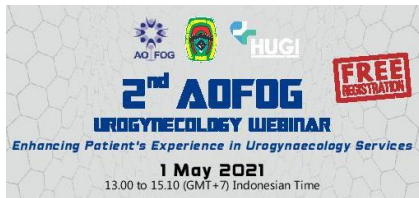
AOFOG Urogynaecology Webinar