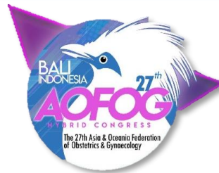
AOFOG Congress 2022